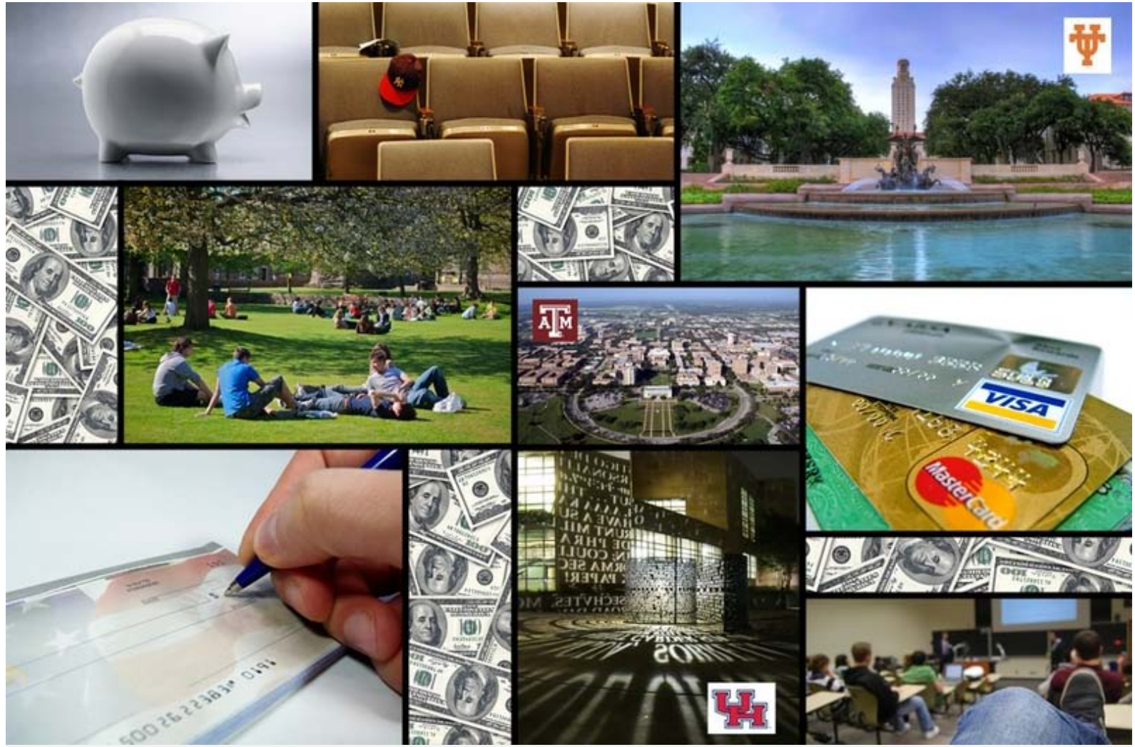
Illustration by Todd Wiseman